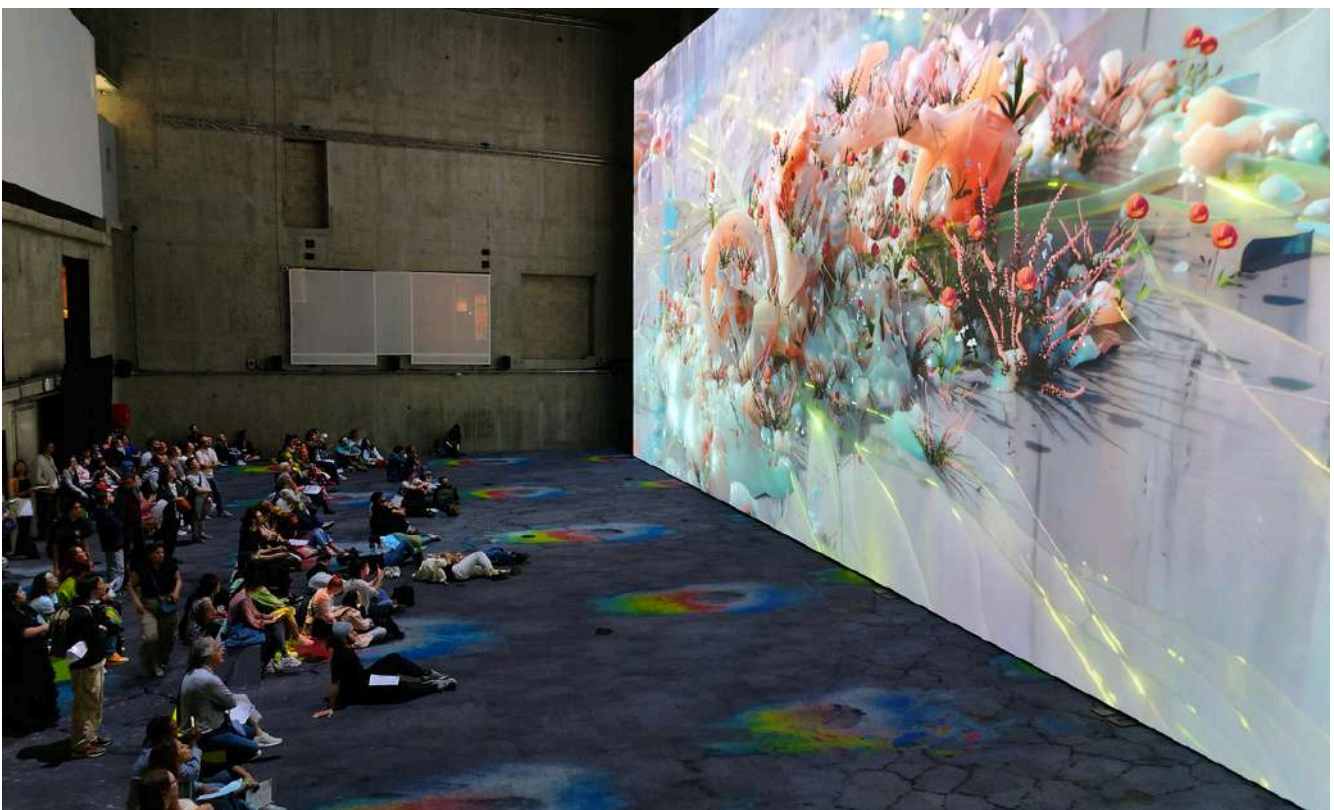
Plane of incidence I, 3'54"

Single-channel videos _ Soundtrack by Roger Tellier-Craig