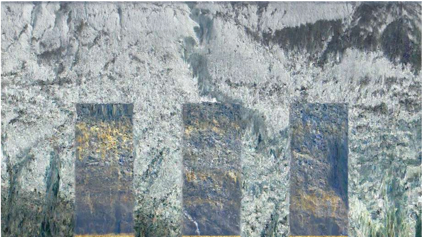
Le Mont Blanc de Tours 2022 (2021-2022), installation single channel 4K video, variable (large) dimensions

Extending the reflections of the film Before the Collapse of Mont Blanc , the piece explores the slow geological and temporal forces that shape mountainous landscapes. Mountains rise and fall in the same movement, reminding us that even as we attempt to reach and master their summits, they remain part of a dynamic process that endlessly transforms the world.