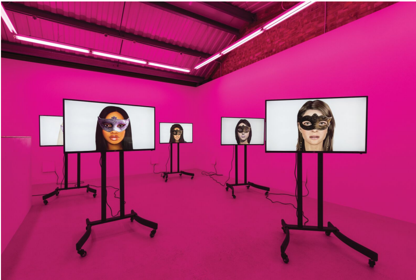
! Mediengruppe Bitnik - Ashley Madison Angels at Work in Paris 2017.